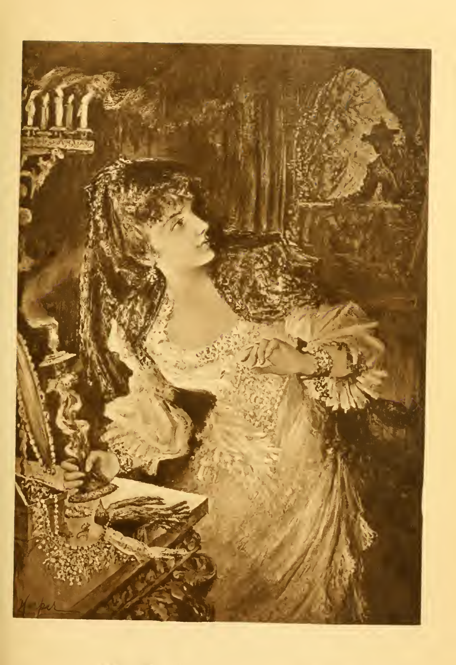
My Futher comes my Firther